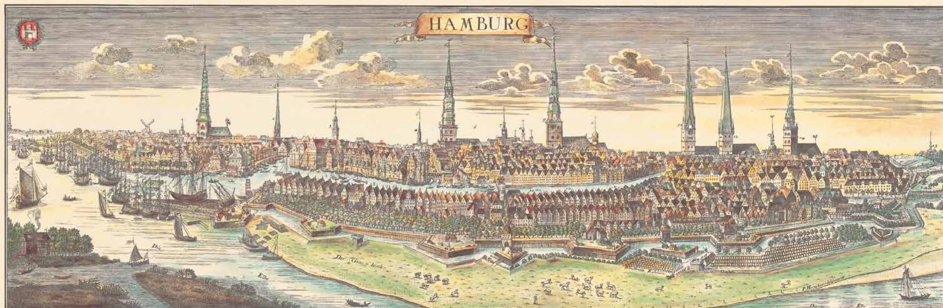
1. Das alte St. Nikolai Kirch. 2. Das alte Michaelis Kirch. 3. Das Waisenhaus. 4. Das H. Geist Kirch. 5. S. Nicolai Kirch. 6. S. Marien Kirch. 7. Das Roth. Henk. 8. Die Post. 9. S. Catharinen. 10. S. Johani. 11. S. Petri. 12. S. Petri. 13. Das Thom. 14. S. Gertrud. 15. S. Laurentii. 16. S. Georg. 17. S. Georg. 18. S. Anna. 19. Das Bism. Henk. 20. S. Petri. 21. S. Petri. 22. Das Horn. Werk. 23. S. Petri. 24. S. Petri. 25. S. Petri. 26. S. Petri. 27. S. Petri. 28. S. Petri. 29. S. Petri. 30. S. Petri. 31. S. Petri. 32. S. Petri. 33. S. Petri. 34. S. Petri. 35. S. Petri. 36. S. Petri. 37. S. Petri. 38. S. Petri. 39. S. Petri. 40. S. Petri. 41. S. Petri. 42. S. Petri. 43. S. Petri. 44. S. Petri. 45. S. Petri. 46. S. Petri. 47. S. Petri. 48. S. Petri. 49. S. Petri. 50. S. Petri. 51. S. Petri. 52. S. Petri. 53. S. Petri. 54. S. Petri. 55. S. Petri. 56. S. Petri. 57. S. Petri. 58. S. Petri. 59. S. Petri. 60. S. Petri. 61. S. Petri. 62. S. Petri. 63. S. Petri. 64. S. Petri. 65. S. Petri. 66. S. Petri. 67. S. Petri. 68. S. Petri. 69. S. Petri. 70. S. Petri. 71. S. Petri. 72. S. Petri. 73. S. Petri. 74. S. Petri. 75. S. Petri. 76. S. Petri. 77. S. Petri. 78. S. Petri. 79. S. Petri. 80. S. Petri. 81. S. Petri. 82. S. Petri. 83. S. Petri. 84. S. Petri. 85. S. Petri. 86. S. Petri. 87. S. Petri. 88. S. Petri. 89. S. Petri. 90. S. Petri. 91. S. Petri. 92. S. Petri. 93. S. Petri. 94. S. Petri. 95. S. Petri. 96. S. Petri. 97. S. Petri. 98. S. Petri. 99. S. Petri. 100. S. Petri.

At this time in his career, Telemann started to become interested in a more systematic way of addressing his public. Publications around the end of the 1720s include: the first volume of the cantatas of the ‘Harmonische