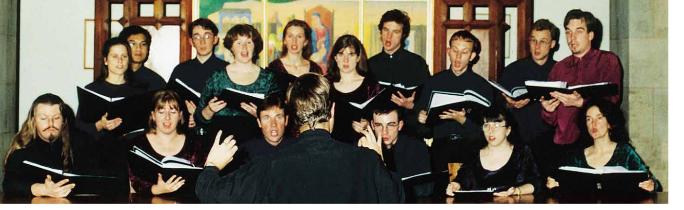
Schola Cantorum of Melbourne