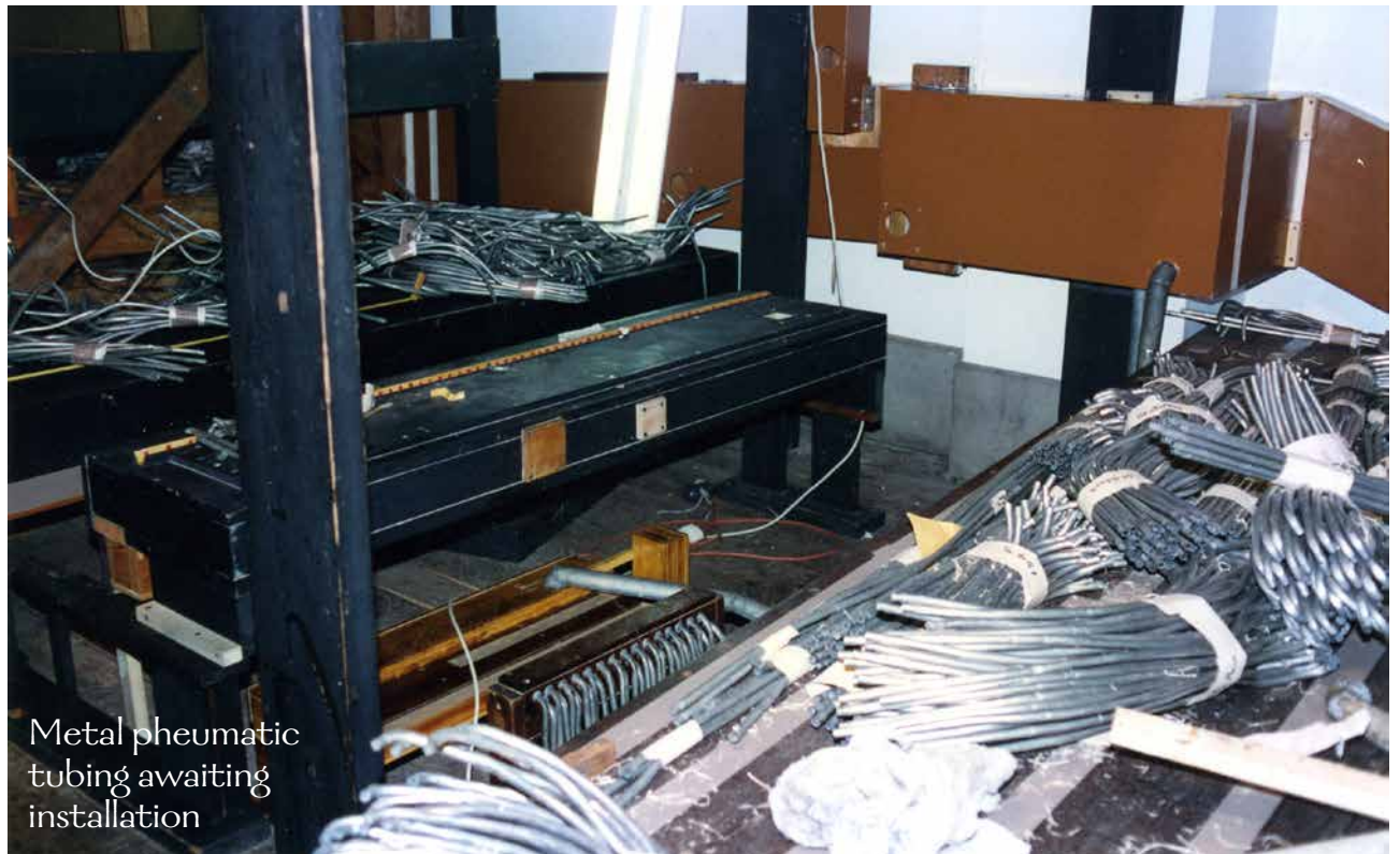
Metal pneumatic tubing awaiting installation

playable at the time of its dismantling in March 1992. It had not received any major attention since the 1940s and much of the original mechanism had not been repaired since 1900. The instrument's wind system (comprising three large double-rise wind reservoirs and long lengths of wooden trunking) was in a decayed state owing to the perishing of the original leather joints and water penetration on numerous occasions. The 1940s blowing plant could scarcely cope with leakage on such a scale. Additionally, much of the tubular-pneumatic action had ceased to function owing to perished