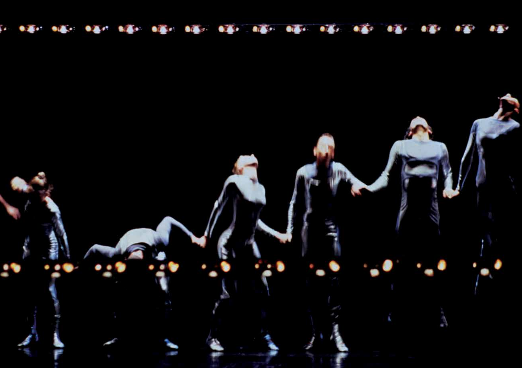
Carl Vine Piano Sonata : Sydney Dance Company