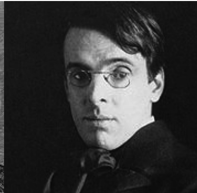
William B Yeats 1865-1939