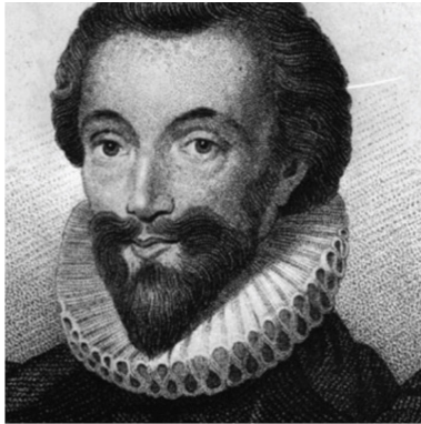
George Herbert 1593-1633