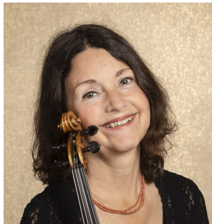
THE HOLLAND TRIO