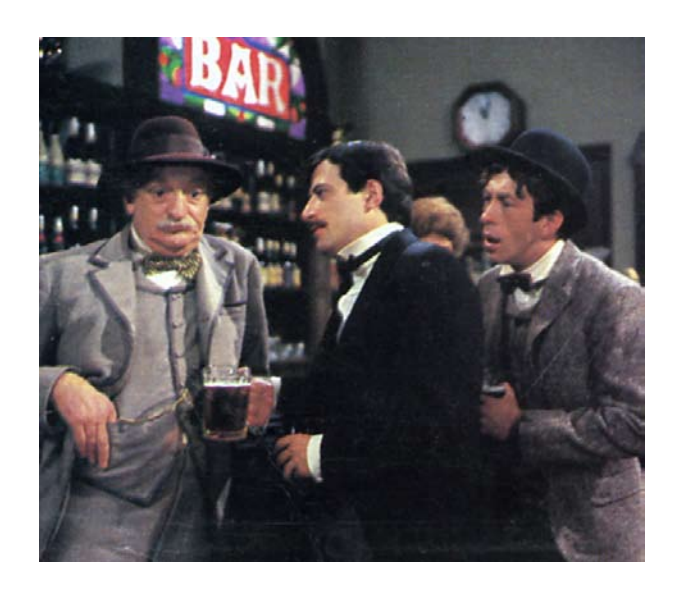
4 LAWSON'S MATES (1979)

the country and the conclusion the splendour of the magnificent balloon in flight.