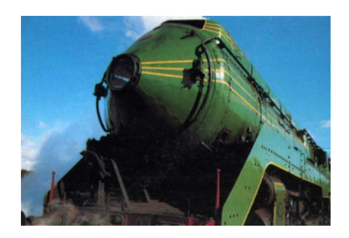
8 A STEAM TRAIN PASSES (1974)