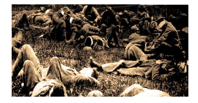
9 SONS OF THE ANZACS – 'Peace' theme (1969)

placing therefore special responsibility on the composer. In the opening sequence we can hear the "beautiful beast" getting up steam, then we travel with it through the gentle Australian countryside, follow it through a dream sequence and finally see it disappear into distant nothingness.