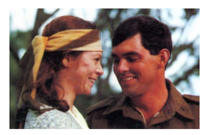
2 BREAK OF DAY (1976)