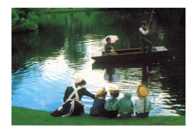
5 POWER WITHOUT GLORY – main theme (1976)

wrote a theme, full of warmth and friendly compassion. It is in the style of an Australian folk-song without being derived or based on one, this being what the Israeli composer Alexander Boscovich once aptly called "imaginary folk-lore". Actors Max Gillies and Graeme Blundell, now both household names, acted in the series.