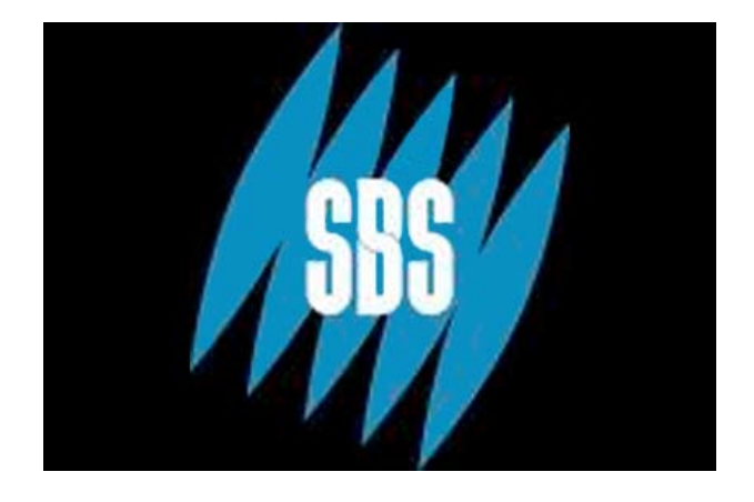
11 WE BELONG (1979)

arranged the music into a suite, giving it a more place and person specific title. The music moves from the hopeful optimism of the initial settlers to the calm resignation of the descendants nearly a century later.