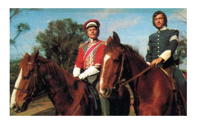
1 RUSH (1974)