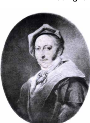
Rossini in 1820