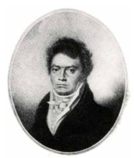
Beethoven in 1814

We can therefore assume that he supervised Sedlak's authorised transcription of Fidelio. There are many cuts and alterations to the original which must have had Beethoven's approval. Sedlak's Fidelio appeared on 27 January, 1815.