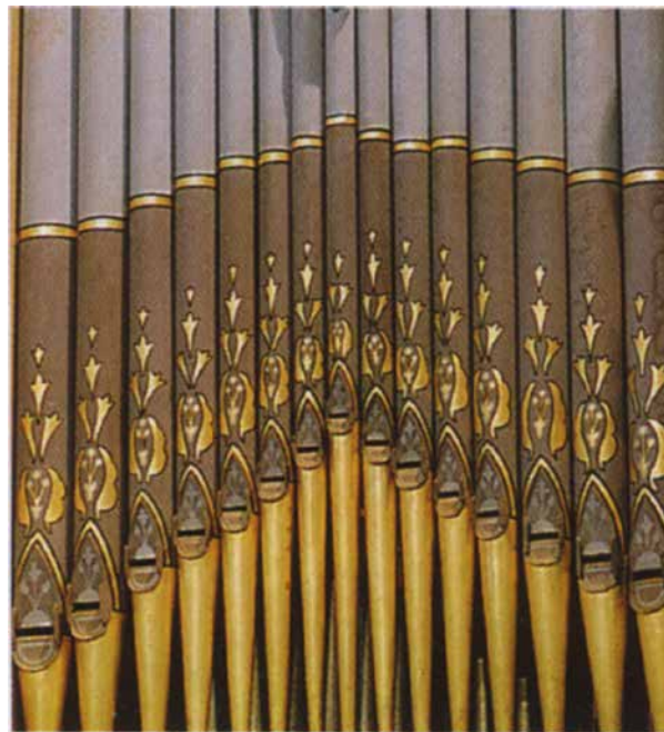
Kapunda facade pipes

The township of Kapunda lies just north of the Barossa Valley proper and owes its existence to the first major discovery of copper in South Australia. Found by Francis Dutton in 1842, mining commenced two years later. By 1851 there was a prosperous mining