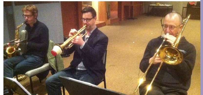
Recording the soundtrack