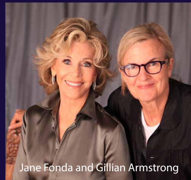
Jane Fonda and Gillian Armstrong

"Towards the end of the film there is a more reflective, contemporary sound, but the final music cue brings back an extended version of the main theme – orchestral, choral and quirky cha cha."