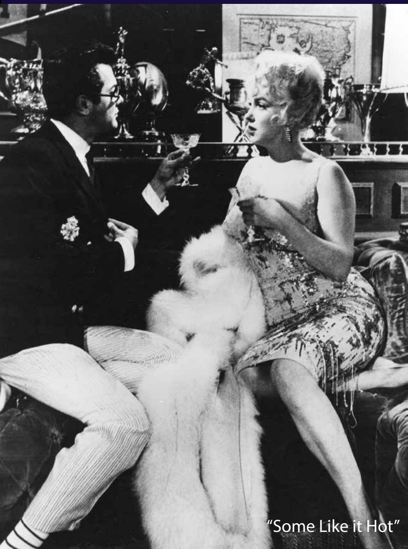
"Some Like it Hot"