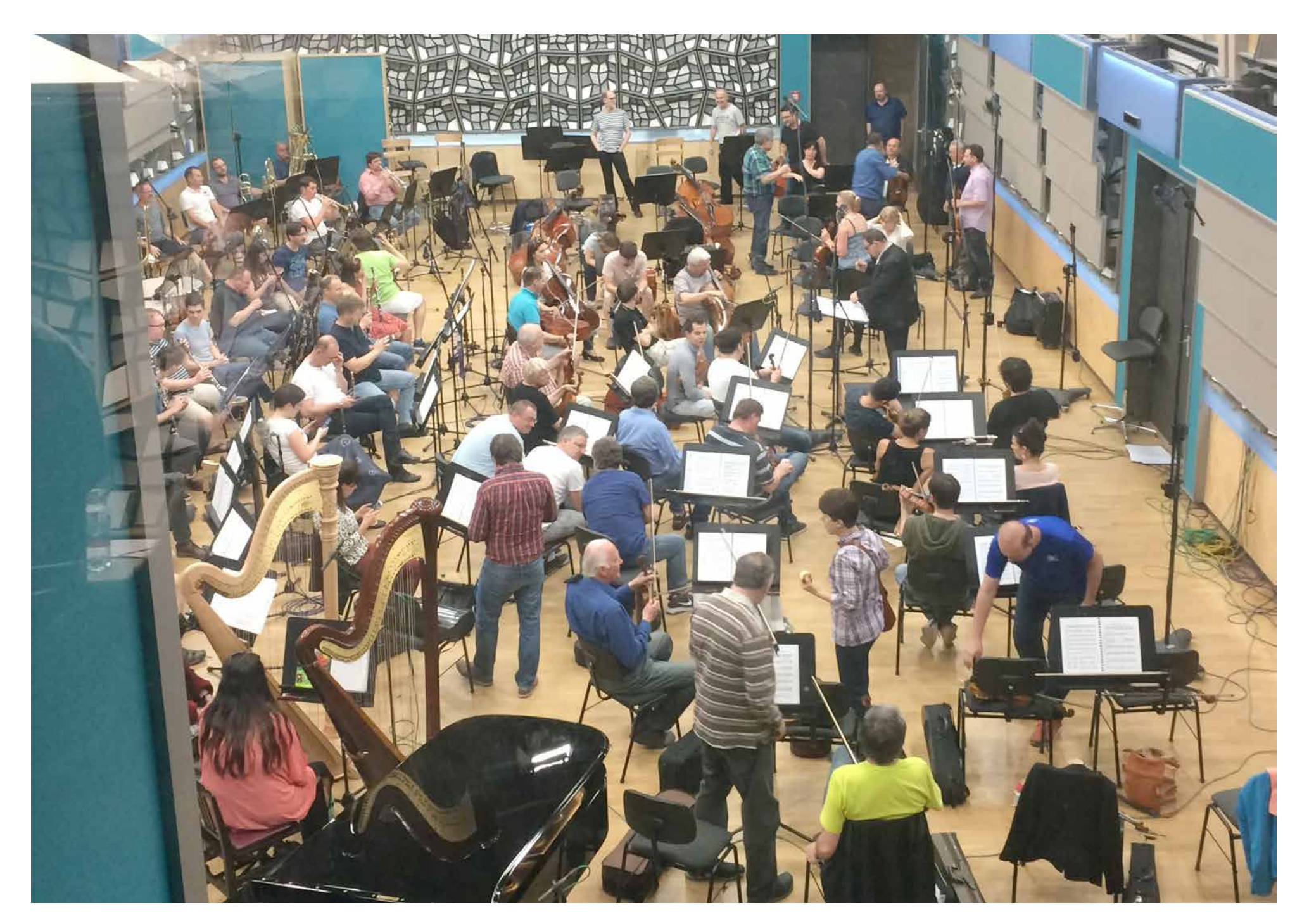
Recording sessions in Prague Radio Studio